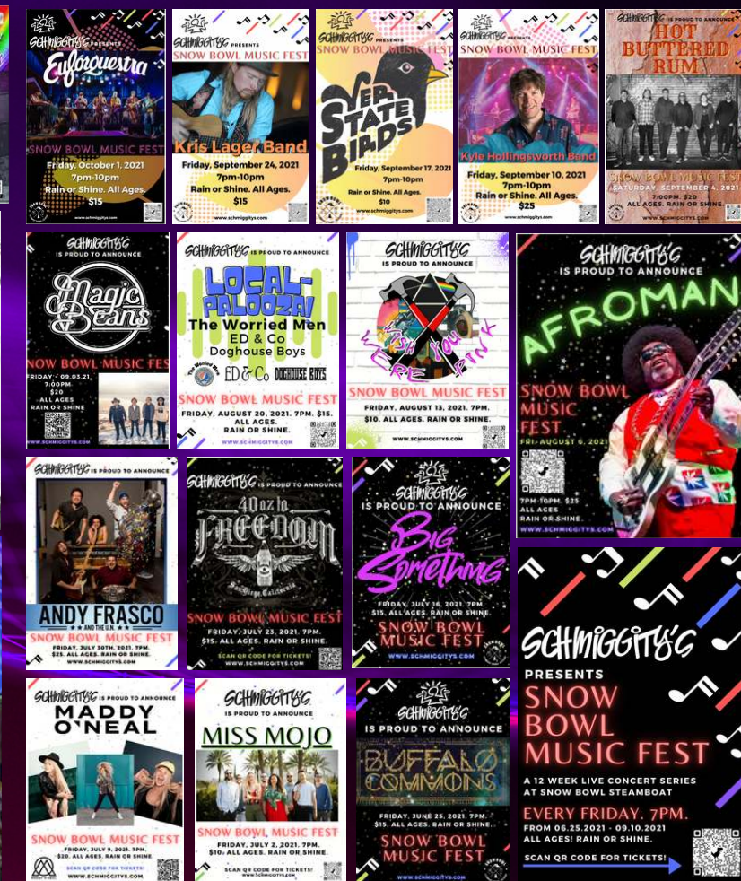
2021 SNOW BOWL MUSIC FEST