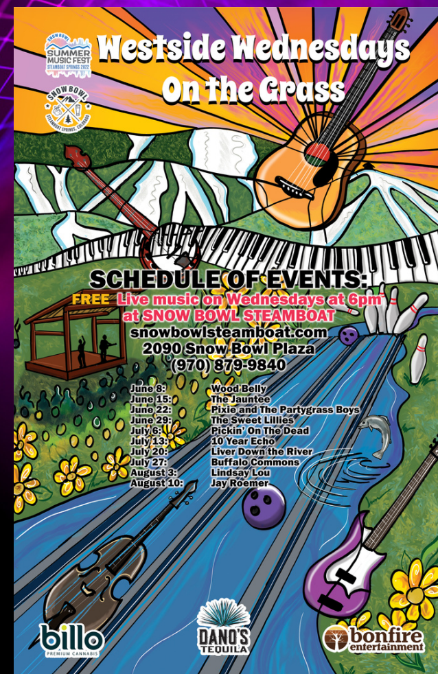
2022 FREE WESTSIDE WEDNESDAYS ON THE GRASS