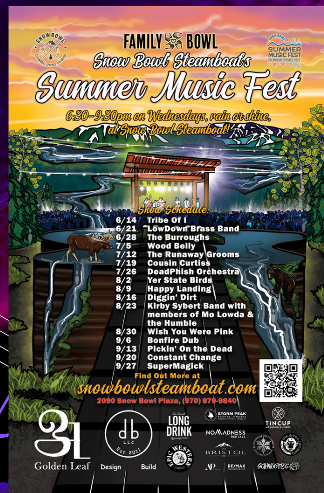
2023 FREE SNOW BOWL SUMMER MUSIC FEST

In 2022, the music fest consisted of 10 free shows and 14 paid shows, with an attendance of nearly 11,000 guests, averaging 455 guests per show. In 2023, Snow Bowl decided to make the entire music fest free, offering 16 shows, and averaging 579 guests per show. In 2024, the series will remain free with 22 shows, beginning Memorial Day weekend and continuing through the summer on Wednesday nights and select weekends. It is expected to be the best attended series yet!